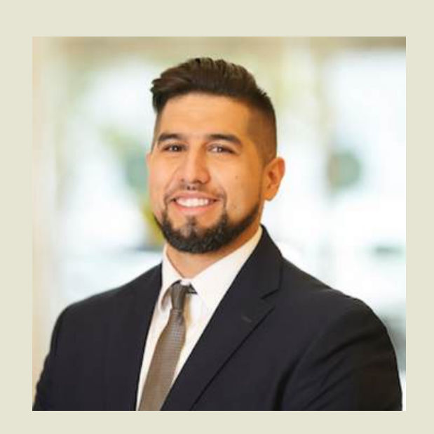
Federal & Regulatory Affairs Professional Primacy Strategy Group