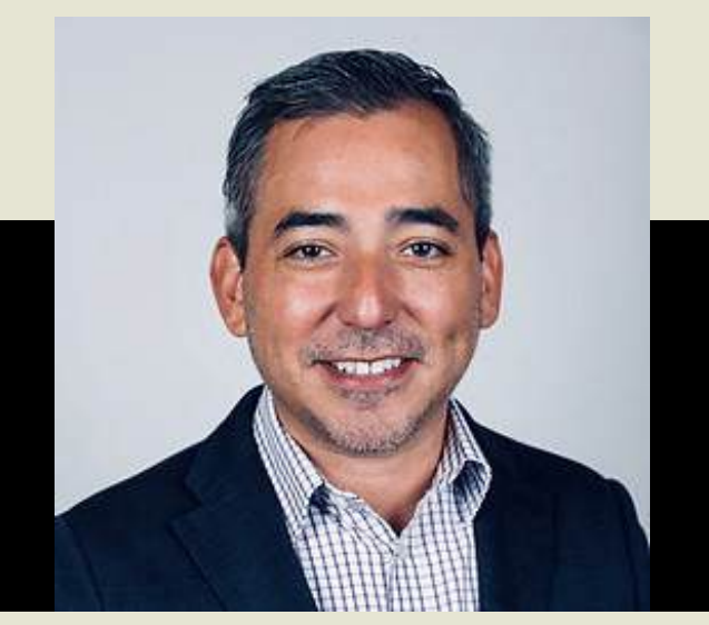
Partner Capitol Counsel, LLC